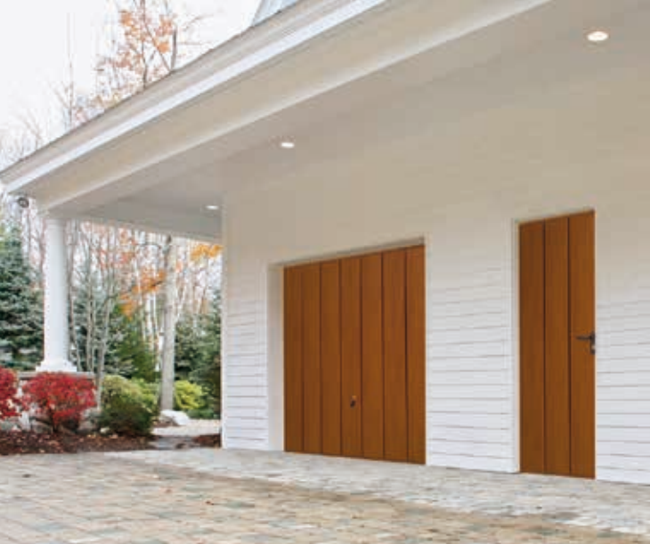
For garage and side door glazing and handle options, see page 17.