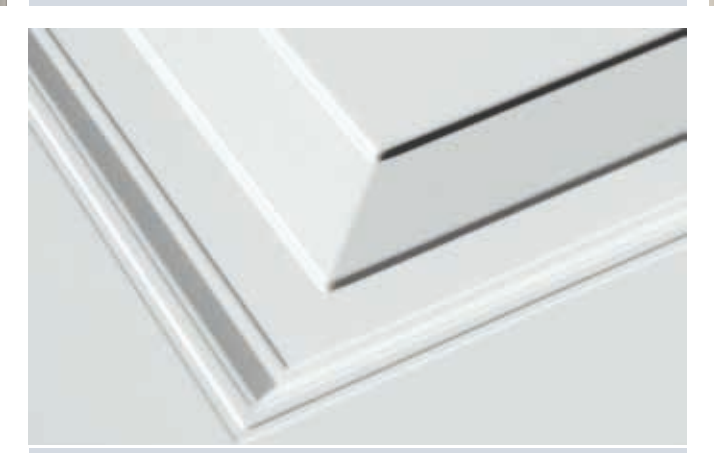
An expressive look and a lasting surface finish

The door is galvanised with a high-quality polyester powdercoating and comes protected against adverse weather conditions and corrosion, maintaining the long term beauty of the door.